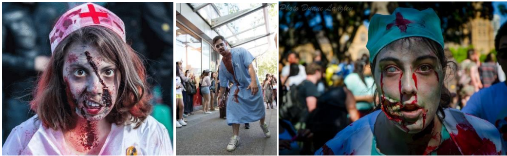
Hospital staff are among the most susceptible to infection.

OCEA (AP) – Despite the best efforts of national and international partners, the Borceia flu is spreading across the country in epidemic proportions. Initially isolated in areas around Borceia and a few rural enclaves, the disease is spreading at a rapid pace and the first cases of infection have already been reported in the capital. The initial sites of quarantine are now overrun with infected individuals exhibiting signs of advanced stages of the disease, described by some as rabid behavior.